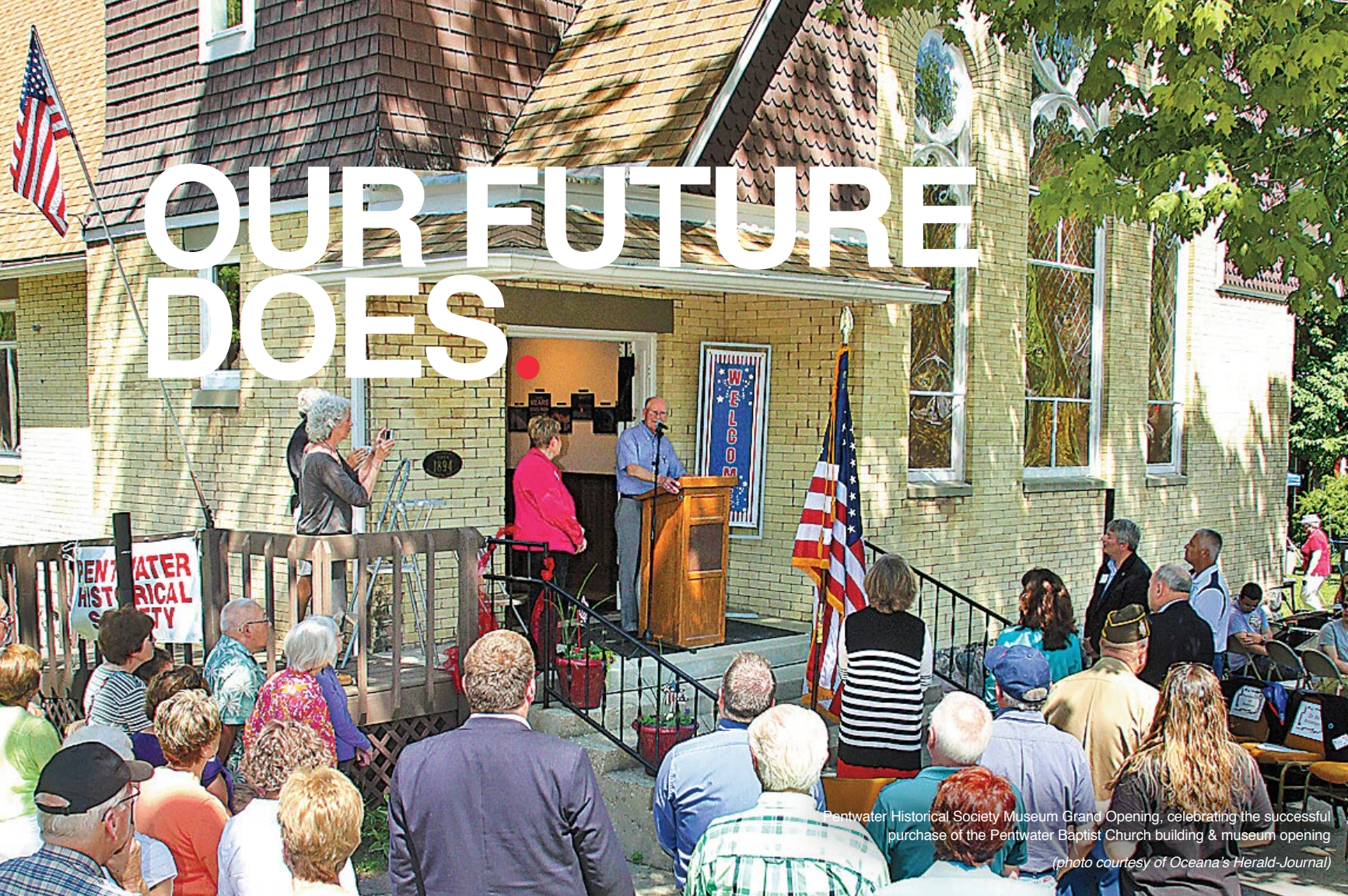
Pentwater Historical Society Museum Grand Opening, celebrating the successful purchase of the Pentwater Baptist Church building & museum opening