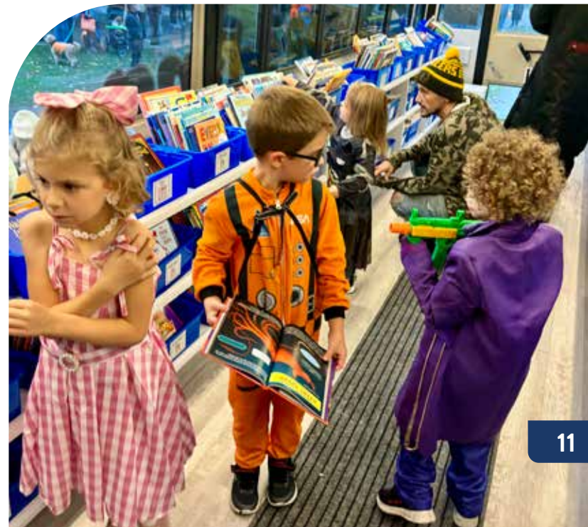
Children selecting new books from the Literacy Bus