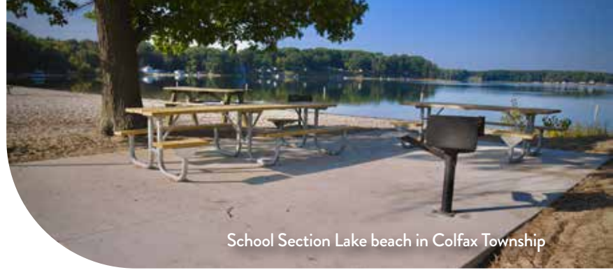
School Section Lake beach in Colfax Township

School Section Lake beach in Colfax Township welcomes summer visitors from neighboring campgrounds and year-round residents to its shore. Colfax Township used a $4,000 grant to replace its outdated cooking grill and non-accessible