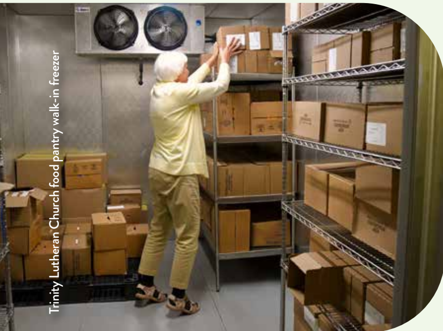
Trinity Lutheran Church food pantry walk-in freezer

When the Foundation established its Urgent Needs Fund during the COVID-19 pandemic, its Board of Directors recognized that its purpose would outlive the pandemic as families struggled to meet their basic needs. Now, five years after COVID's original appearance, the Urgent Needs Fund continues to help address resource gaps and barriers throughout the county. In 2022, the Fund awarded $5,000 to the Oceana County United Way of the Lakeshore's two emergency cash assistance programs in Oceana County, providing household emergency loans and reimbursements for basic needs like food or rent. While the Community Foundation's Urgent Needs Fund continues to be strong after its fifth anniversary, it is only one way that the Community Foundation invests in multiple types of resources to meet residents' basic needs.