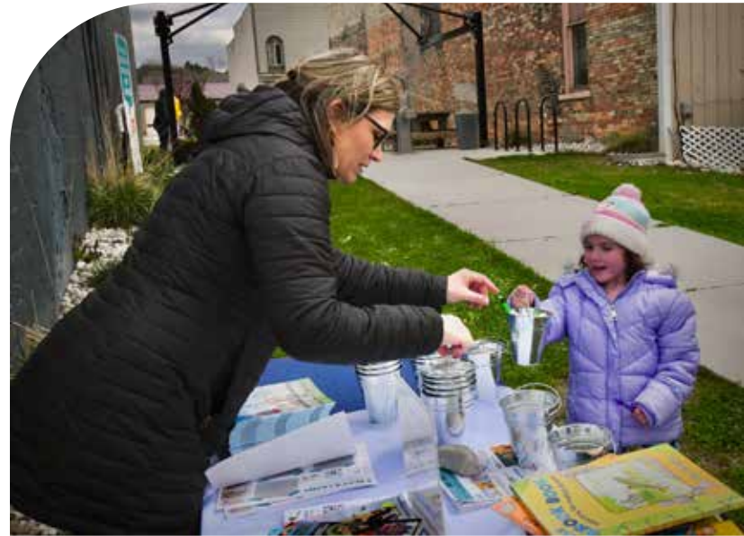
Child enjoying the "Have You Filled a Bucket Today" pop-up book walk

During the Foundation's Community Grant Rounds in 2023, Pentwater and Walkerville Public Schools each received $5,000 in awards to invest in multi-year initiatives. Pentwater Public Schools is revamping its music program over the next three years by purchasing new percussion instruments through an award from the Oceana Youth Fund and the Little Point Sable Arts Fund. Thanks to a $5,000 award from the Oceana Youth Fund and the Ordoobadi Family Fund, Walkerville Public Schools sent the school's talented paraprofessionals to the HIVE Literacy Conference in Denver. With your help, the Foundation is investing in the future of our community.