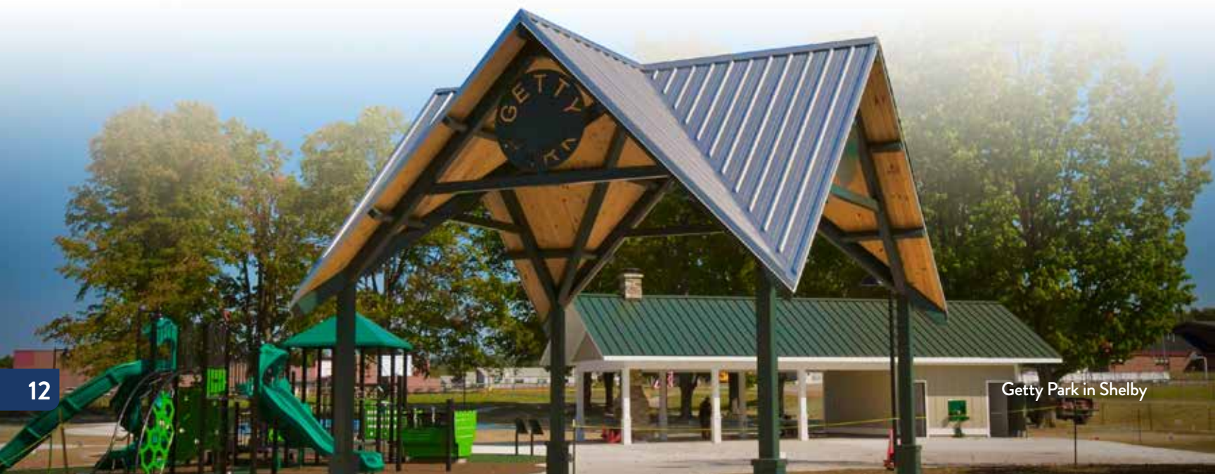
Getty Park in Shelby

Getty Park has fulfilled many roles in the community of Shelby — it's a hangout for students after school, a recreational space for athletes, and a playground for young children and their parents. Conveniently located near the Shelby District school complex and downtown Shelby, the renovated park will add new amenities for the community to enjoy. In partnership with the Shelby Optimists Club, the Getty Park Renovation Fund at the Foundation helped to seed initial fundraising efforts of over $140,000 towards community matches of state grants. The Park is slated to get open in 2025 and will be larger than the original, offering a fireplace, covered pavilion, pickleball and basketball courts and a much-anticipated splash pad.