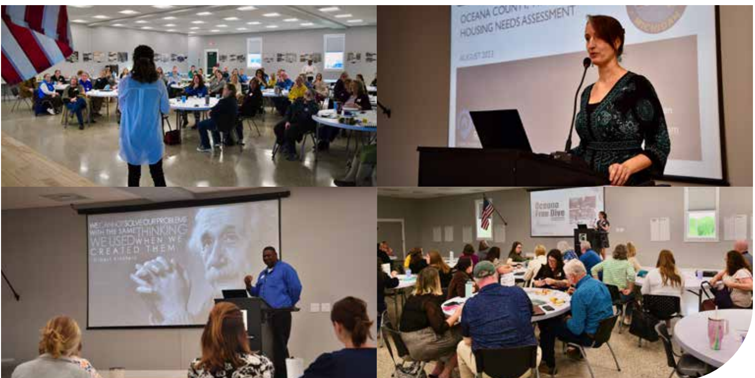
Quarterly Nonprofit Education and Networking Series - growing relationships and collaboration.

Just as the Foundation continues to invest in local nonprofits, other foundations are investing in our organizational growth. The Foundation received numerous grants in the past year to build programmatic and organizational capacity. The Gerber Foundation has been a long-time supporter of Read Early, Read Often, including a recent award of $8,000 to purchase new literacy materials. Trinity Health awarded the Oceana College Access Network and Complete Your Degree scholarship program with a combined $25,000, and $5,000 from the Richard M. Schulze Foundation supported the Urgent Needs Fund. The generous support from Michigan’s foundations to the Foundation extends past supporting programs. The MET Foundation awarded $5,000 to unrestricted grantmaking and operational capacity and the Council of Michigan Foundations granted Foundation staff $1,700 towards professional development. Lastly many donors have contributed to our operations and administrative funds, helping to meet expenses and engage in leadership activities.